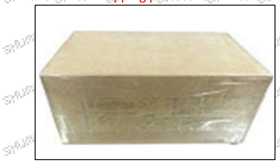
Pic No.2 Domestic express packaging:

A Minors are prohibited from using transparent tape, yellow tape, black wrapping protective film, and white wrapping protective film to avoid personal injury.