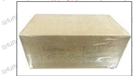
Pic No.2 Domestic express packaging:

A Minors are prohibited from using transparent tape, yellow tape, black wrapping protective film, and white wrapping protective film to avoid personal injury.