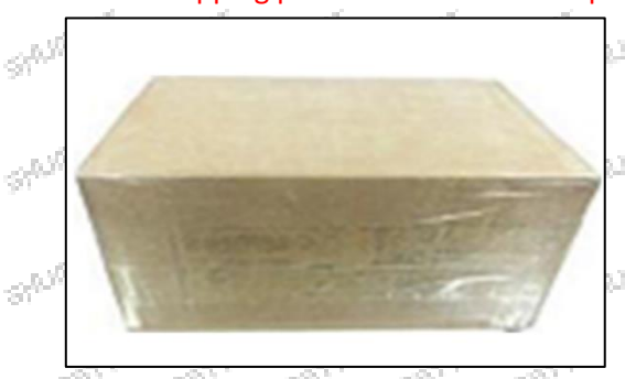
Pic No. 1 Domestic express packaging: Wrapped by Transparent tape