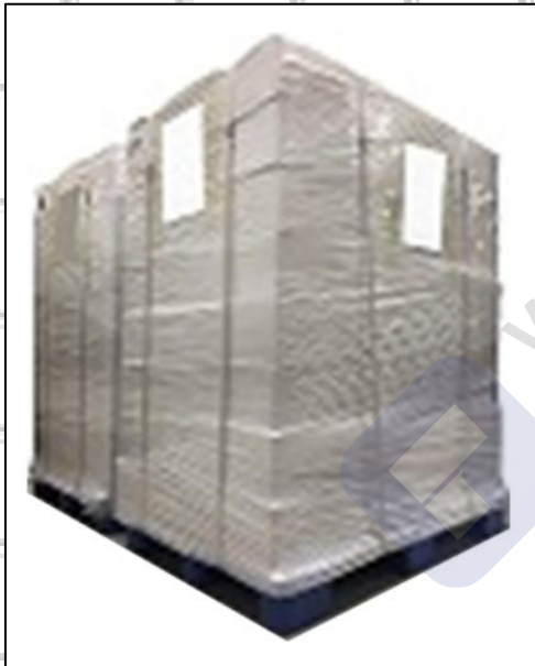
Pic No. 3

International express packaging: Wrapped with yellow tape after wrapping black protective film