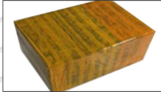
Pic No. 2

Domestic express packaging: Wrapped by Transparent tape