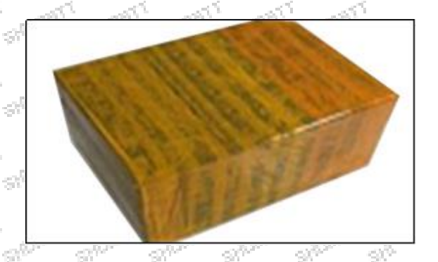
Pic No. 3 International express packaging: Wrapped with yellow tape after wrapping black protective film 1000