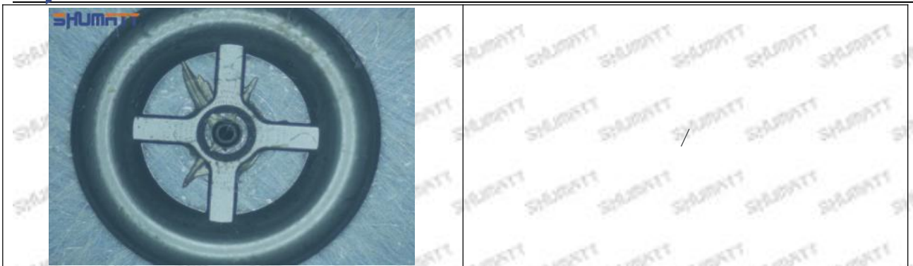
The wear of the middle oil back-flow hole causes gap between semi ball and orifice plate, and causes the orifice plate to be washed out by high-pressure oil