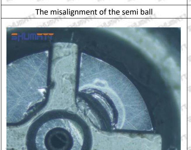
The indentation of the misalignment of the semi ball