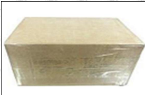
Pic No. 1