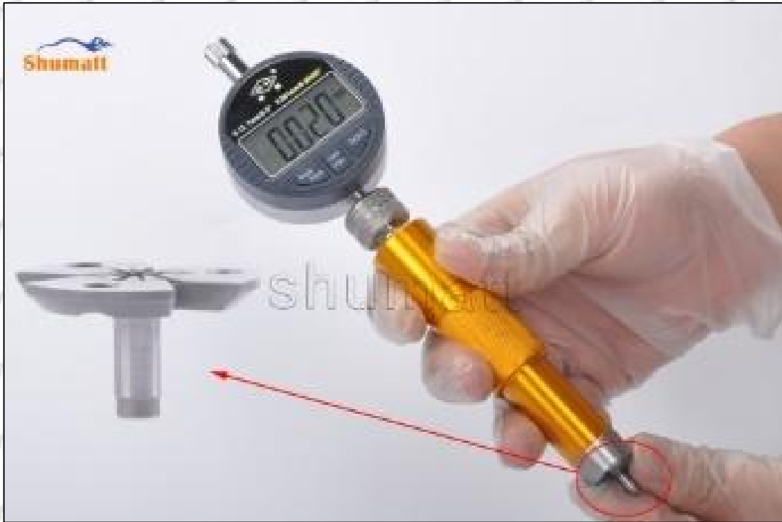
Pic No. 7

(8) The measurement of air clearance is in the normal range, within 45-50 (um) microns, see as Pic No. 7