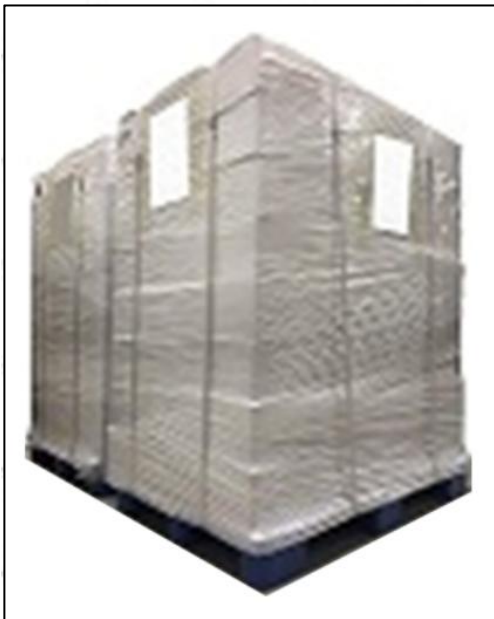
Pic No. 3

Wrapped with yellow tape after wrapping black protective film