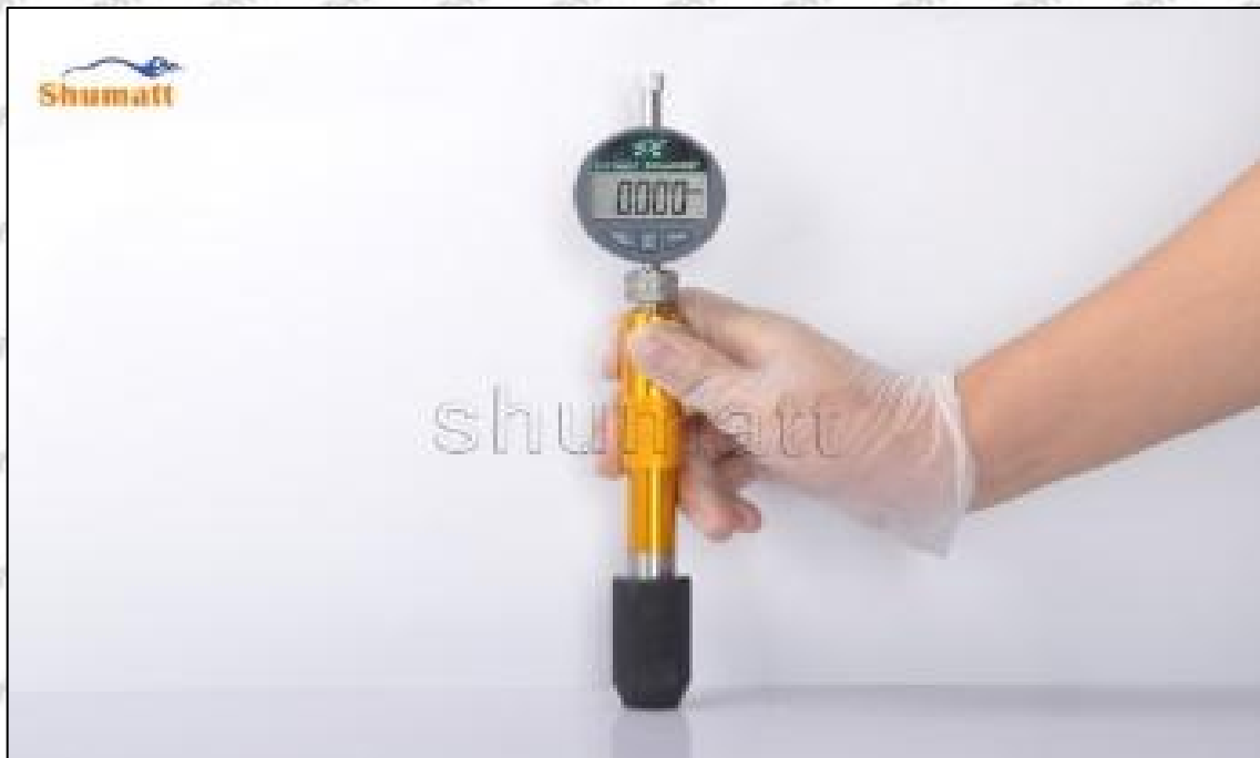
Pic No. 6

(7) Install the air clearance lift measuring tool and dial gauge in the measuring tool (CRT220) and place it at zero port for air clearance measurement, see as Pic No. 6