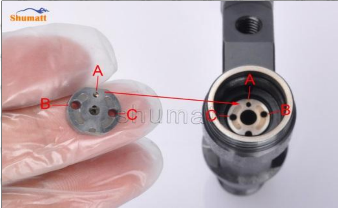
Pic No. 1