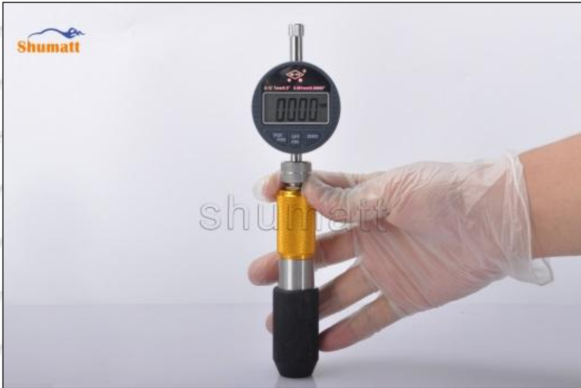
Pic No. 3

(5) Place the buffer lift measurement tool and dial gauge in the measuring tool (CRT220) at zero port for buffer stroke measurement, see as Pic No. 3