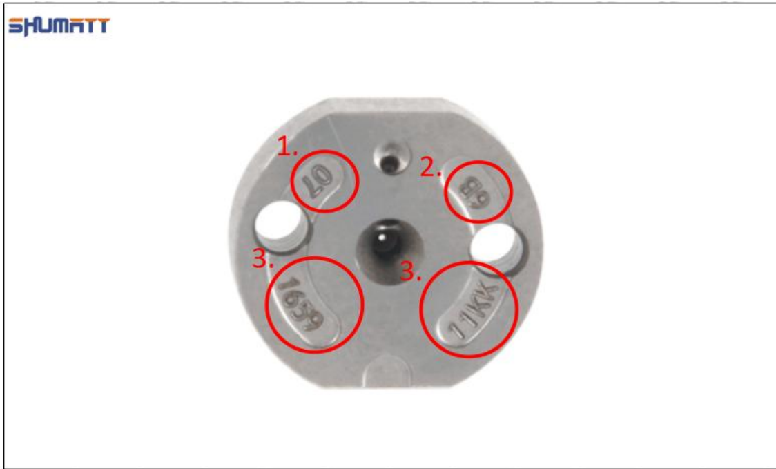
Pic No. 1