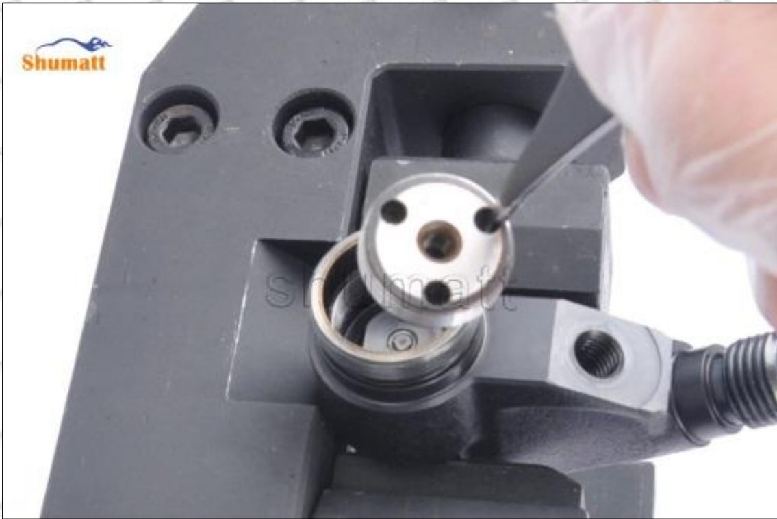
Pic No. 9

(10) Install the (CRT230) 3-jaw tool inside the CRT029 on the lock nut, see as Pic No.10