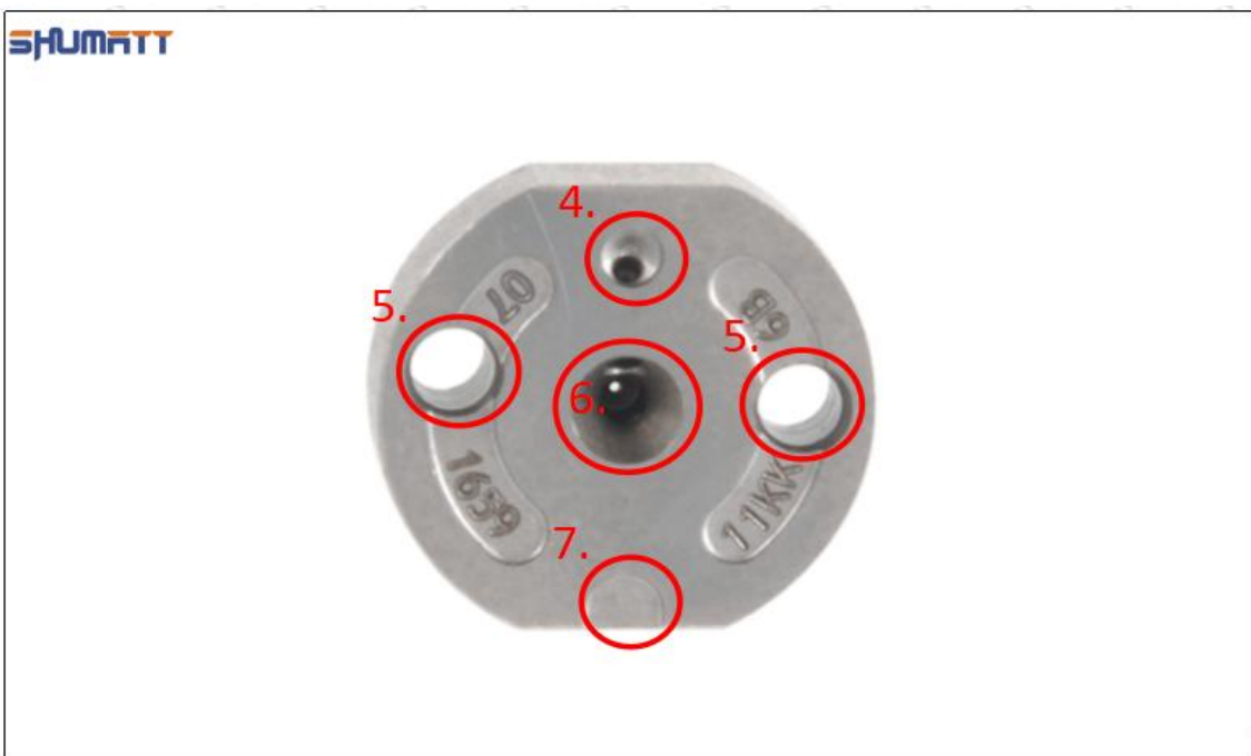
Pic No. 2