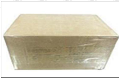
Pic No. 1